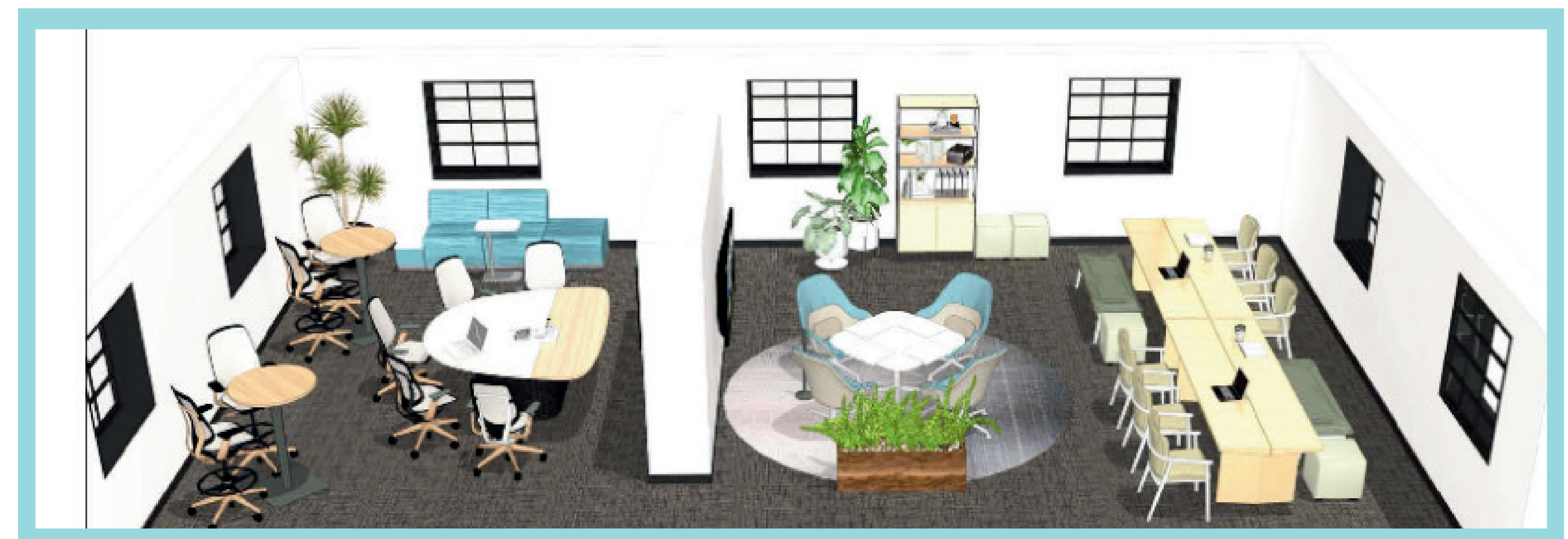
Community Work Zone

The first floor offers several spaces to pop into for studying, impromptu meetings, or a moment of solace. These spaces are not reservable and you are welcome to come and go as you need.