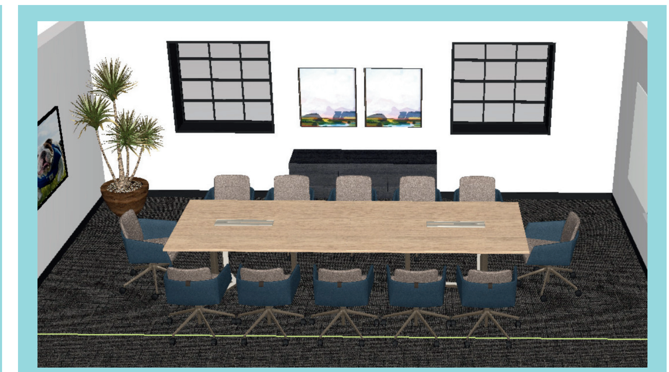
Meeting 106 and Meeting 108

You will find several six to ten person conference rooms throughout the building. These are reservable spaces for meetings throughout the day and evening hours.